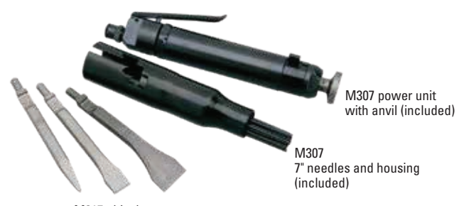
M317 chisels (included in M317 kit, or sold separately)