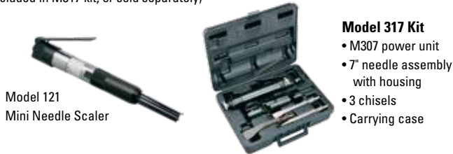
Model 121 Mini Needle Scaler