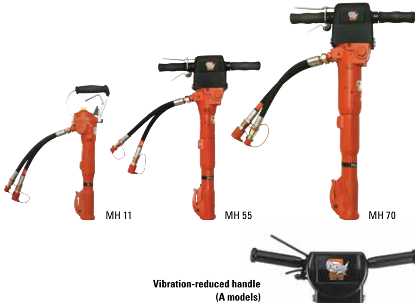
Vibration-reduced handle (A models)