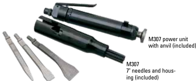
M307 power unit with anvil (included)