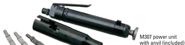
M307 power unit with anvil (included)