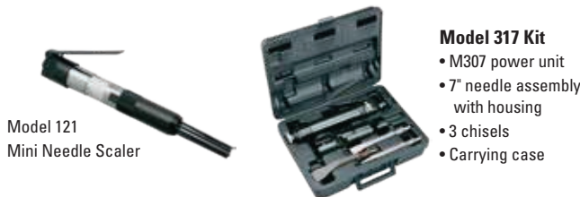
M317 chisels (included in M317 kit, or sold separately)